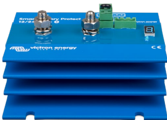
Smart BatteryProtect BP-220