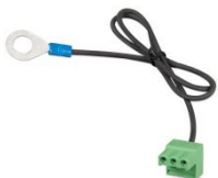
Connector with preassembled DC minus cable (included)