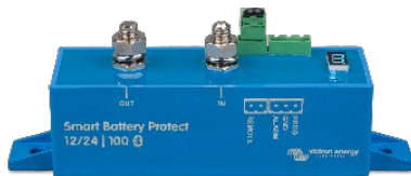
Smart BatteryProtect BP-100